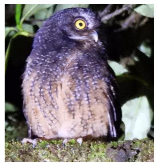
cloud forest and its incredible birdlife.

We will return for another overnight stay at Guango Lodge, surrounded by the serenity of the Andean cloud forest.